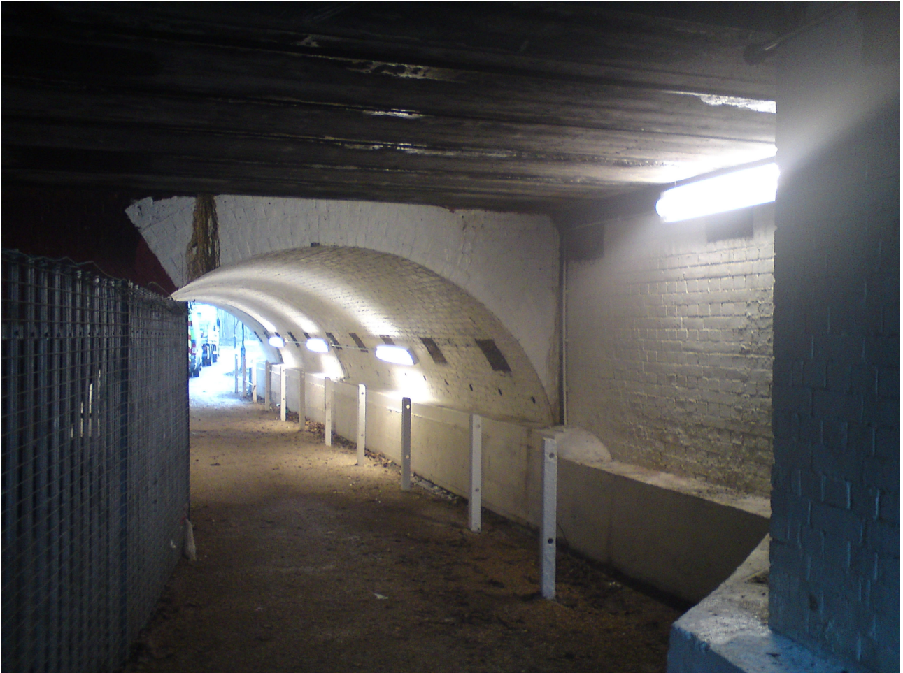
PHOTO OF SALT HILL TUNNELL WITH NEW LIGHTS

SLOUGH LOCAL ACCESS FORUM – 12 th January 2010